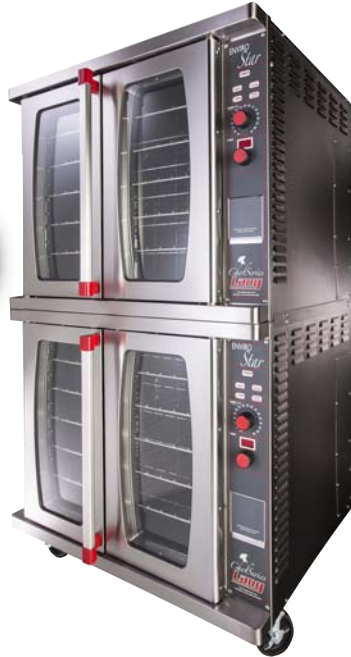
Model ECSF-ES2 shown