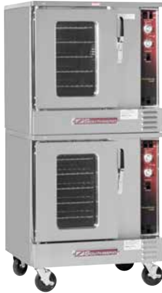
EH/20SC shown with optional casters