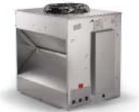
ECC1200 Remote Condensing Unit