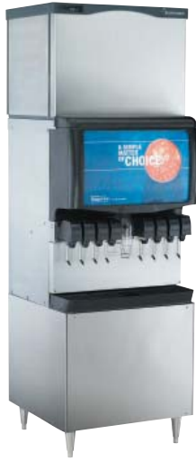
EH330 shown on beverage dispenser.