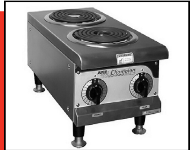
Model EHP Electric Hot Plate