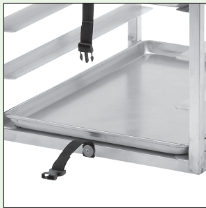
/015 Pan Stop Web-Strap