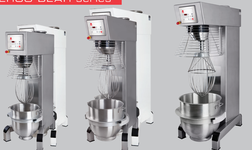
ERGO BEAR 60 Qt. ERGO BEAR 100 Qt. ERGO BEAR 150 Qt.