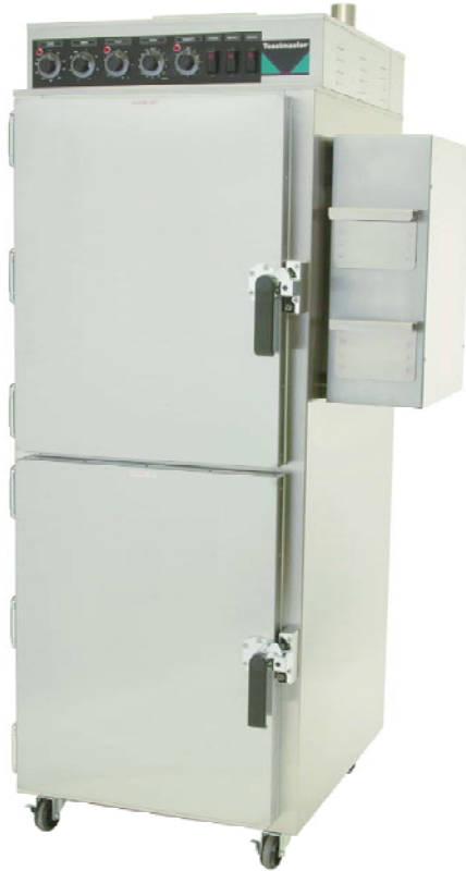
Shown with optional external smoke box