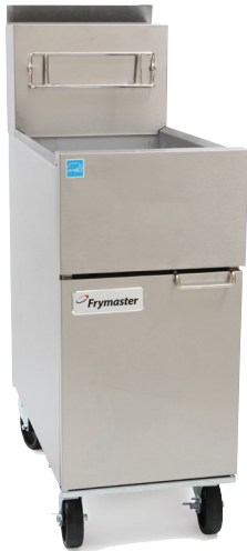
ESG35T Shown with optional casters.