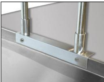
INCLUDES ANGLE BRACKETS

8 ft. units are furnished with three (3) sets of tubing supports.