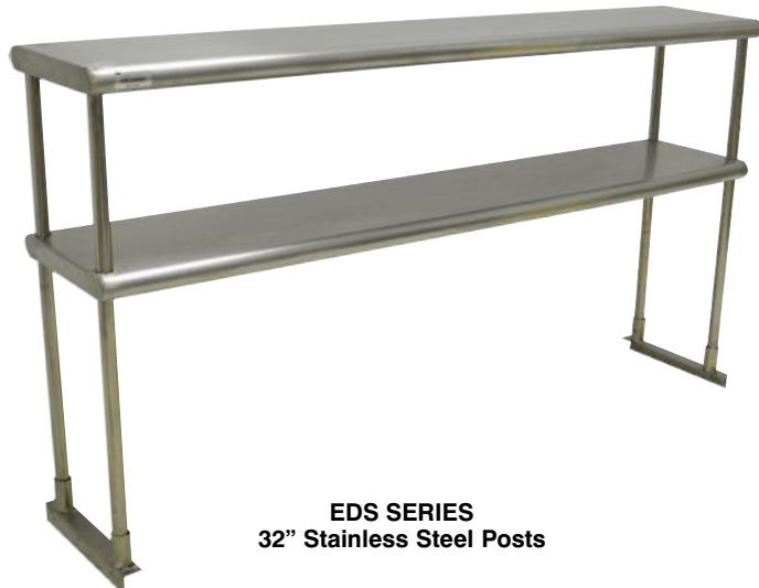
EDS SERIES 32" Stainless Steel Posts