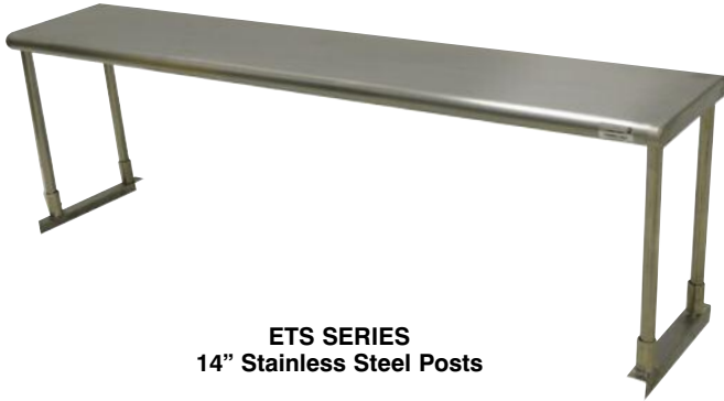
ETS SERIES 14" Stainless Steel Posts