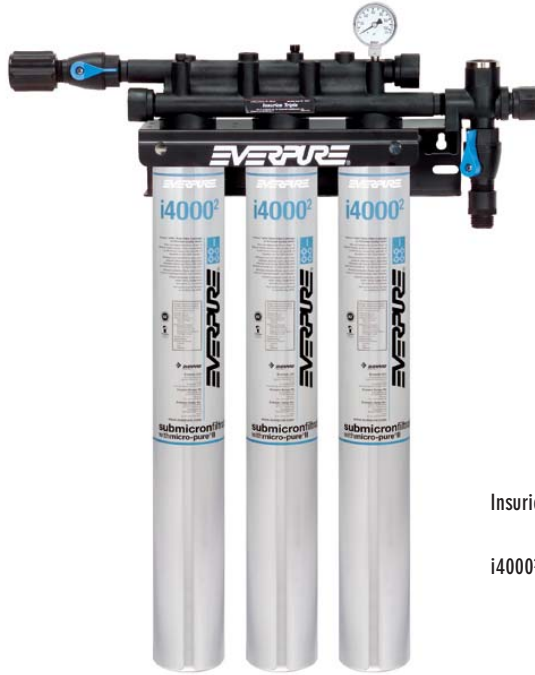
Insurice Triple-i4000 2 System: EV9325-03

Delivers premium quality water for ice applications