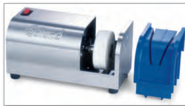
Removable ABS knife guide for easy cleaning