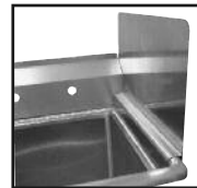
K-700 Removable Side Splashes Fits Left OR Right Side