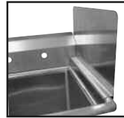
K-700 Removable Side Splashes Fits Left OR Right Side