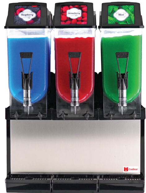
model Frosty 3