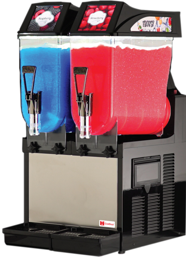
model Frosty 2