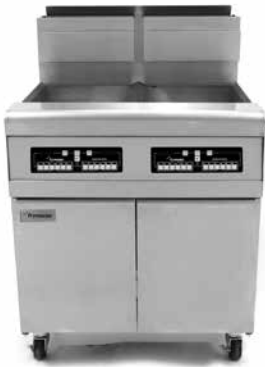
Model FMJ250 Shown with optional CM3.5 controller