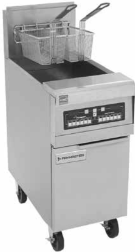
H55 Shown with optional casters