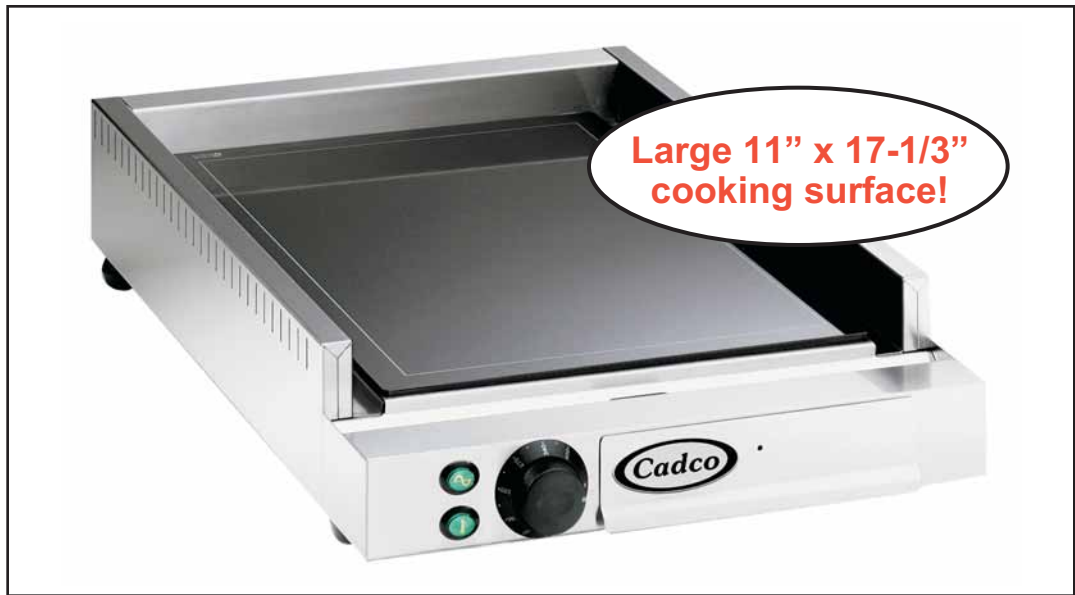
Model FTCG-200 - Glass-Ceramic Fry-Top Griddle