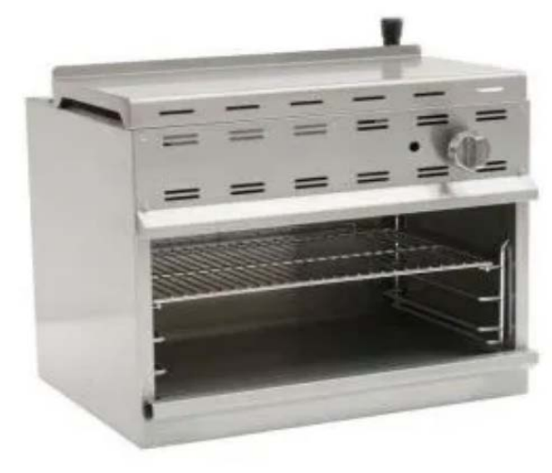
ETL Safety & Sanitation Listed