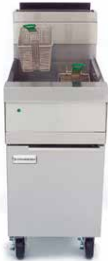
HD160G Shown with optional casters