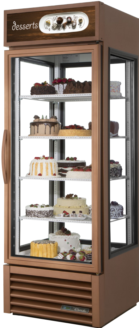
Shown with optional Dessert Sign.

Swing Door Refrigerator with Hydrocarbon Refrigerant~True Standard Look Version 01