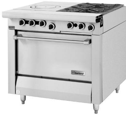
Model MST54R (valve control panel not as depicted)