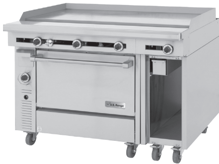
Model C836-48-1 Shown with Optional Casters

Note: Range-based convection oven models can be located in the middle of a battery, banked back-to-back with other equipment, and can be positioned against a wall