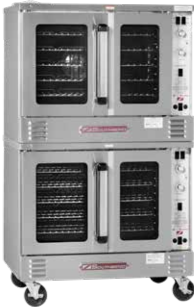
GB/25SC shown with optional casters