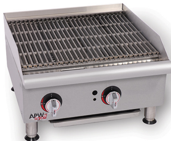
Model GCB-24i Gas Radiant CharBroiler