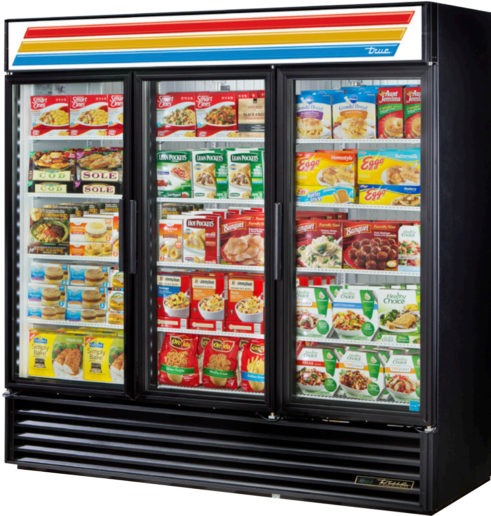
Shown with optional black exterior.

Swing Door Freezer with Hydrocarbon Refrigerant & LED Lighting