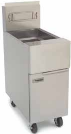
GF40 Shown with optional casters