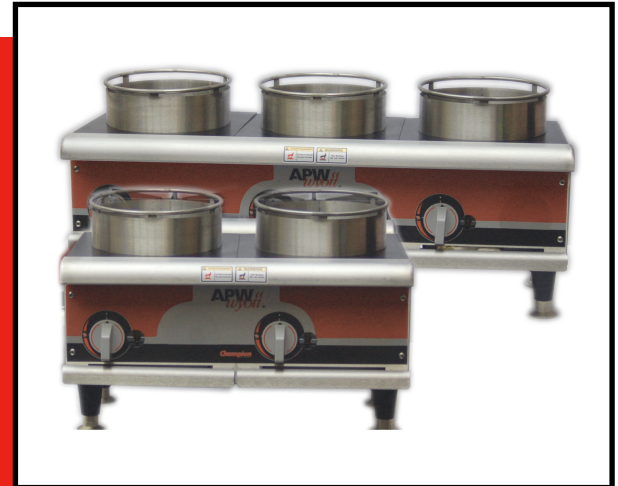
Models GHPW-2H and 3H Shown with optional wok rings

*Warranty does not include cooking grates or fireboxes