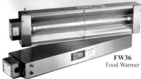
FW36 Food Warmer