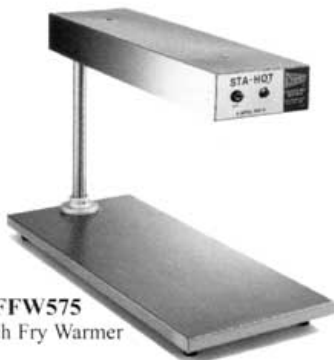
FFW575 French Fry Warmer

When customers come to your store or restaurant, two things are certain: they want their food hot and they want it to taste fresh.