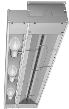
Model GRAML-36 with shatter-resistant incandescent lights, remote control enclosure (not pictured), and standard angle brackets