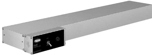
Model GRAM-18 with Control Enclosure with toggle switch and indicator light