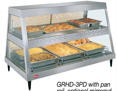
GRHD-3PD with pan rail, optional mirrored glass doors, and accessory food pans