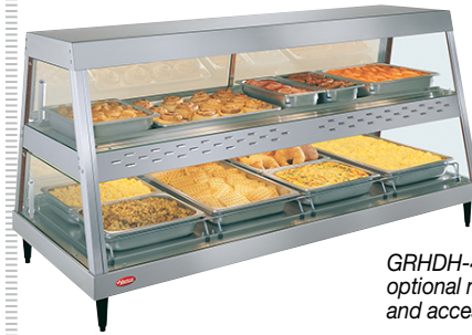
GRHDH-4PD with pan rail, optional mirrored glass doors and accessory food pans