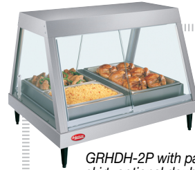
GRHDH-2P with pan skirt, optional double sided opening, and accessory food pans

For operation, location and safety information, please refer to the Installation and Operating Manual.