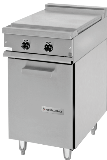
Electric 24" Wide, 70 Pound Capacity Fryer