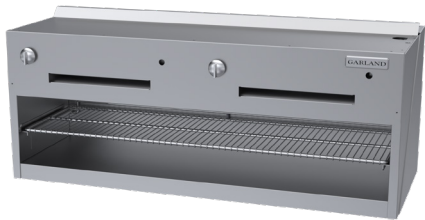
Model shown IRCMA-48