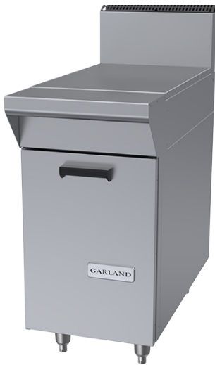
Model M17ES Shown with Optional Backguard

*Note all spreader plate and cabinet models require a high shelf or back guard.