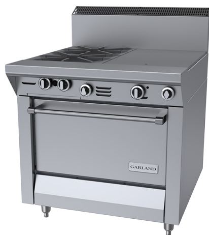
Model M42-6R Shown with Optional Backsplash