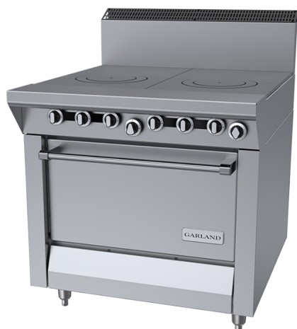
Model M45R Shown with Optional Backguard