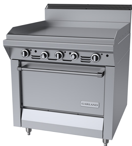
Model M47R Shown with Optional Backguard