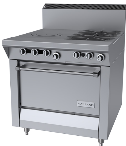
Model M54R Shown with Optional Backguard