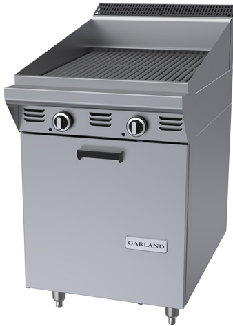
Model MST24BE Shown with Optional Backguard