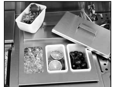
CCD6-12 Installed in the bottle well of a combo ice bin

To view cleaning and care instructions, please visit: https://www.glastender.com/PDF/F-423-011_ss_clean_care.pdf