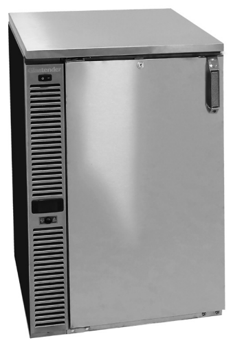
F1SL24 stainless steel door, and stainless steel top