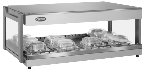
Model GRSDH-36 horizontal single shelf

Equipment On Signage Program Hatcographics.com