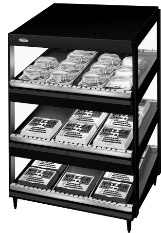
Model GRSDS-24T triple slant shelf in optional Designer black