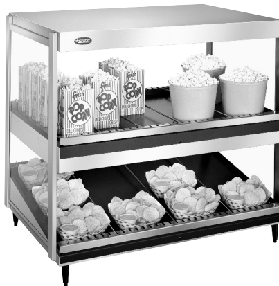
Model GRSDS/H-36D with slant shelf and horizontal shelf