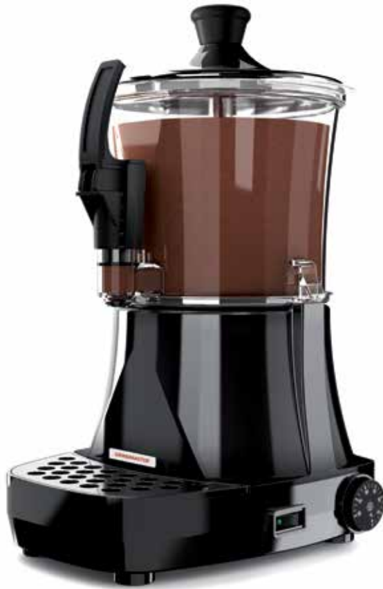
Model Lola 6