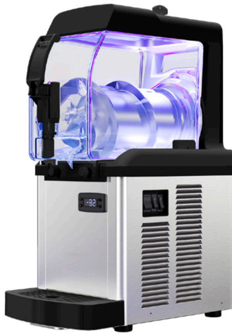
Model SP 1 LED UV