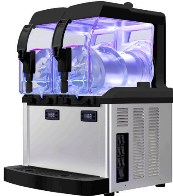
Model SP 2 LED UV