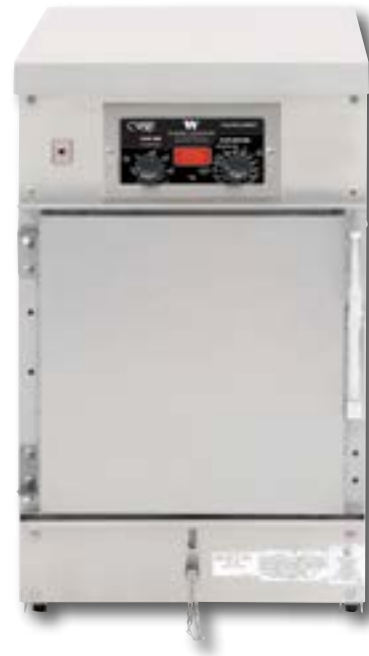
HA4003 CVAP® HOLDING CABINET HALF SIZE, UNDER COUNTER MODEL, FANLESS Electronic Differential Control

CVap equipment complies with domestic and international requirements such as UL, C-UL, UL Sanitation, CE, MEA, and others.