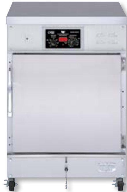
HA4509 CVAP® HOLDING CABINET HALF SIZE MODEL, WITH FAN Electronic Differential Control

CVap equipment complies with domestic and international requirements such as UL, C-UL, UL Sanitation, CE, MEA, and others.