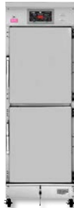
HA4519 CVAP® HOLDING CABINET FULL SIZE MODEL, WITH FAN Electronic Differential Control

CVap equipment complies with domestic and international requirements such as UL, C-UL, UL Sanitation, CE, MEA, and others.