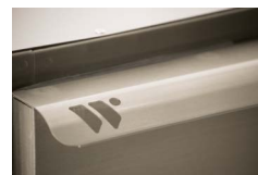
New Handle Design comfortable grip with a sleek modern look.