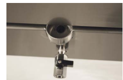
Easy Fill Spout makes filling and draining the unit a snap!

CVap® Hold & Serve Drawers are designed for high quality holding and serving of a wide variety of menu items for extended times. They are ideal for holding, warming, and serving.