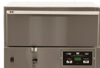
HBB5D1 CVAP® HOLD & SERVE DRAWER WITH FAN

CVap equipment complies with domestic and international requirements such as UL, C-UL, UL Sanitation, CE, MEA, and others.