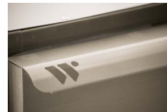
New Handle Design comfortable grip with a sleek modern look.