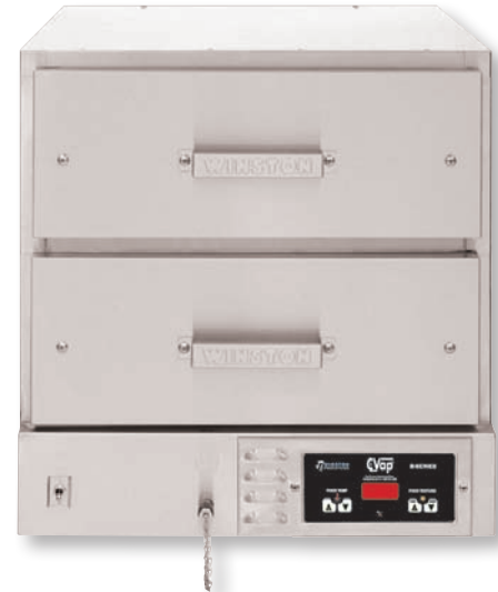
HBB5D2 CVAP® HOLD & SERVE DRAWER

CVap equipment complies with all domestic, and most international requirements, such as UL, C-UL, UL Sanitation, CE, MEA, and others.