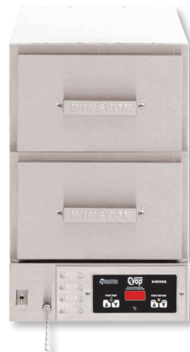
HBB5N2 CVAP® HOLD & SERVE DRAWER WITH FAN Electronic Differential Controls

CVap equipment complies with domestic and international requirements such as UL, C-UL, UL Sanitation, CE, MEA, and others.